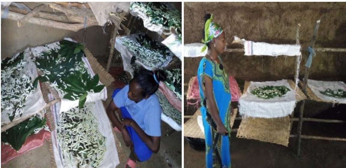
Figure 3. Silkworm rearing at smallholder women Figure 4. Silkworm rearing at youth enterprise

As indicated in Figure (3) and (4), silkworm rearing at both youth enterprise level and smallholder women is not well ventilated and kept sanitized. But, studies conducted in sericulture production identified that silkworm management practices are of vital important success factors for sericulture industry. Among the management practices, silkworm bed spacing plays a major role on growth and productivity of silkworm. Good quality cocoons are produced through applying appropriate silkworm bed spacing and significant deviations from these levels make the cocoon quality poorer (Tilahun et.al., 2017; Pandit et.al., 2008). Rearing room for young silkworm larvae, rearing room for grown silkworm larvae, room for mounting of silkworm larvae, and tools for silkworm rearing must be sanitized and cleaned before, during and after rearing, hands must be washed and shoes changed when entering the rearing room to prevent the introduction of disease-causing bacteria (Pandit et al., 2008). The rearing room surroundings cannot be said to be a sanitary, and rearing rooms that have a dirt floor, clay walls, and a wooden cocooning frame are difficult to disinfect. Furthermore, the rearing bed in direct contact with the silkworms is covered with a plastic sheet, which is used repeatedly, and disinfection and cleaning cannot be completely carried out (Sharma et al., 2015). These shows that sericulture production in study area needs pay attention to upgrade producers' management level.