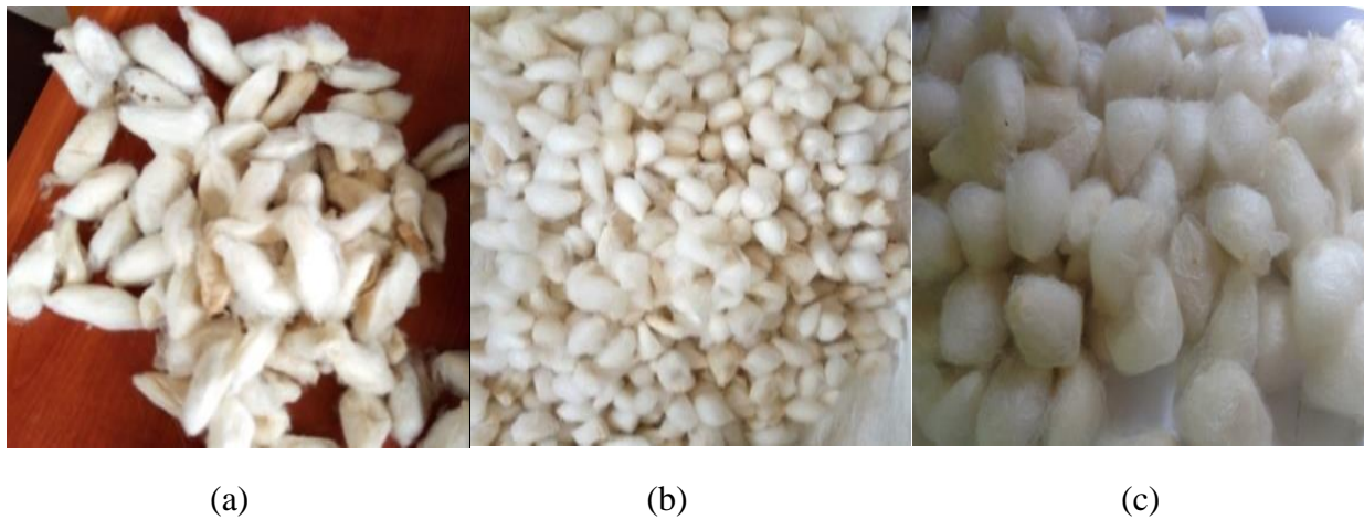
Figure 5. (a) Coon produced by Rural enterprise (b) by smallholder women (c) by Bere sericulture PLC