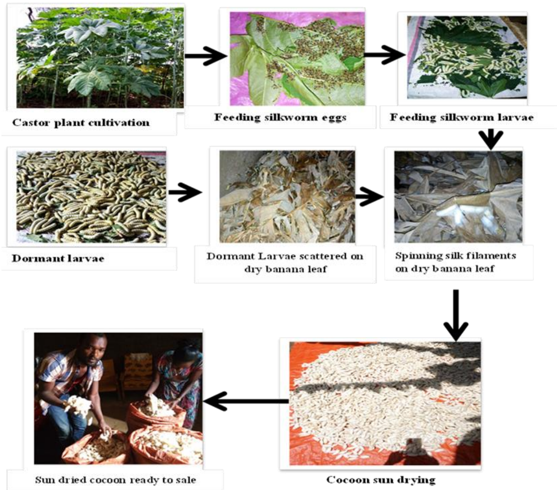
Figure 2. Rural enterprise and smallholder women sericulture value adding activities

all silkworm rearing houses were flordid with mud and did not allow airtation, but silkworm feeding trays were arranged with appropraite spacing. All smallholder women did not have separated rearing house and they use their dining room and salon for silkworm rearing and feeding tray arrangement was not well spaced and some women used the chair and table as feeding tray bed. Both smallholder women and rural enterpsies used dry banana leaf as coconing tray.Both rural youth sericulture producer enterprises and smallholder women bring silkworm eggs from Bere Sericulture PLC and then, they started feeding castor plant leaf. When larvae reached dormant stage they scattered larvae on dry banana leaf to spin silk filaments. When larvae completed silk filament spinning it became cocoon and then, they harvested it at 10 th day of spinning and dried the cocoon with sun after well pupation physiological growth performed.